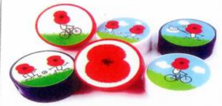
Pencil Sharpener - Suggested Donation: 50p