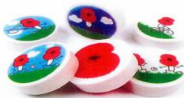
Eraser - Suggested Donation: 50p

If you would be interested, please see Mrs Rawlings Y1/2