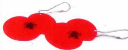
Reflector - Suggested Donation: 50p