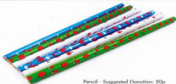
Pencil - Suggested Donation: 50p