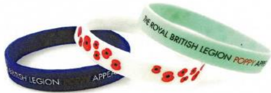
Silicon wristband - Suggested Donation: £1.00