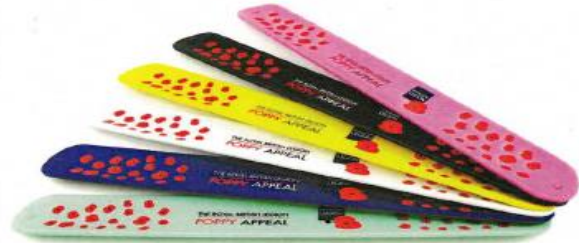
Snap band - Suggested Donation: £1.50