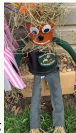
Year 1/2: Archie S