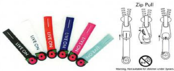
Zip pull - Suggested Donation: 50p