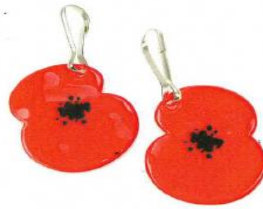
Reflector - Suggested Donation: 50p